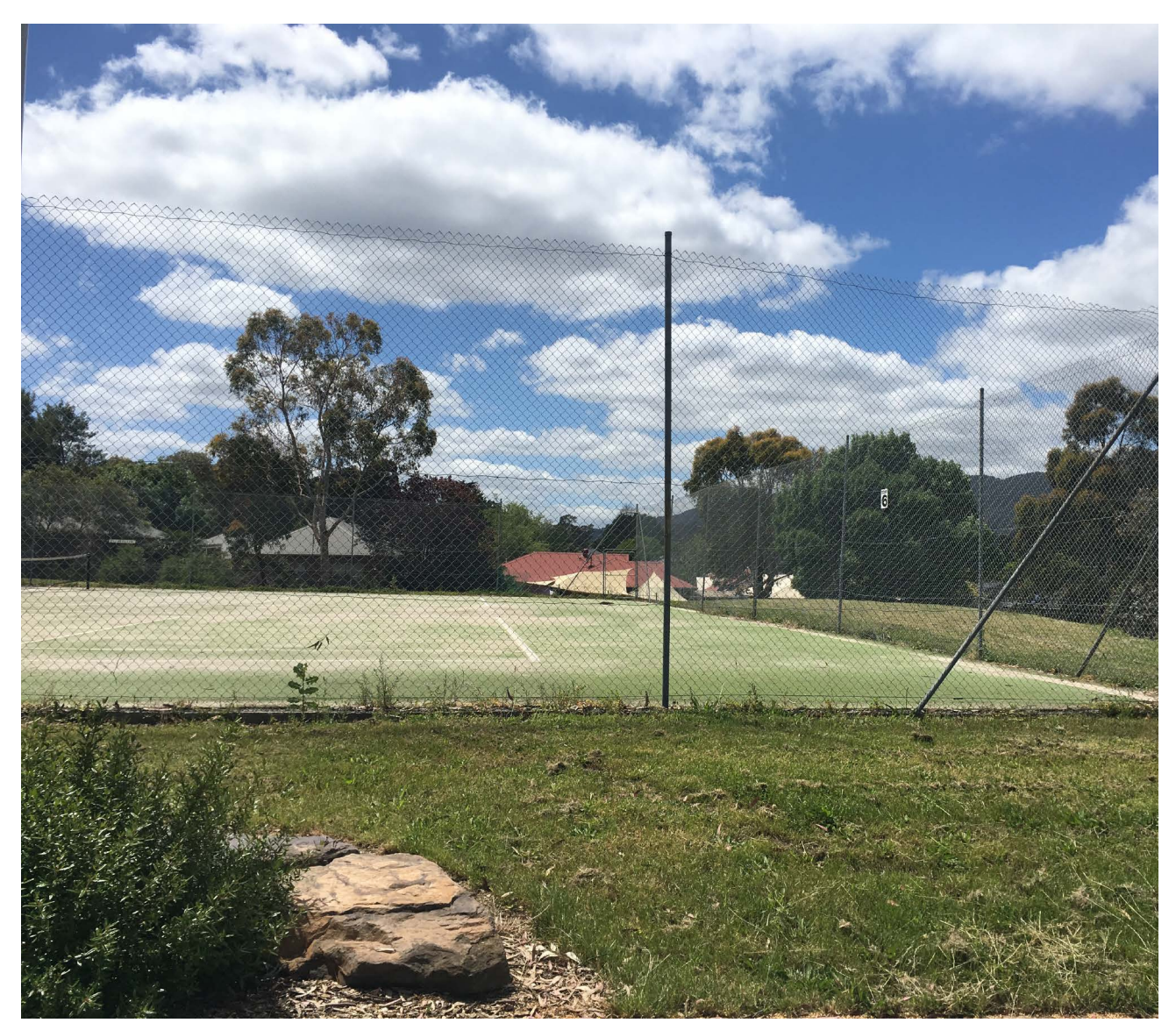
figure 1 Kilsyth Recreation Reserve

Throughout the extensive consultation and development of the Kilsyth Recreation Reserve Master Plan, the identified needs of community members of all ages, gender and cultural backgrounds were taken into consideration. The resultant recommendations of the Kilsyth Recreation Master Plan have a community wide application benefiting the diverse community and aligned with the equality objectives of Council and the Gender Equality Act (2020).