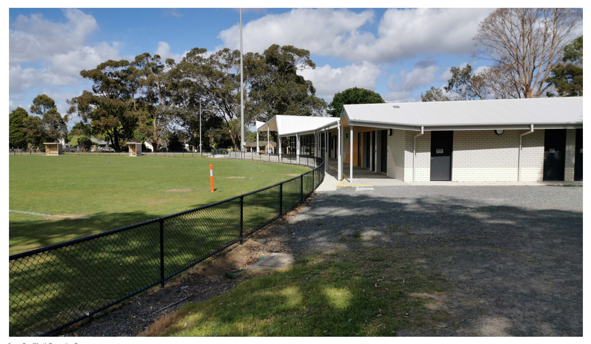
figure 6 Kilsyth Recreation Reserve