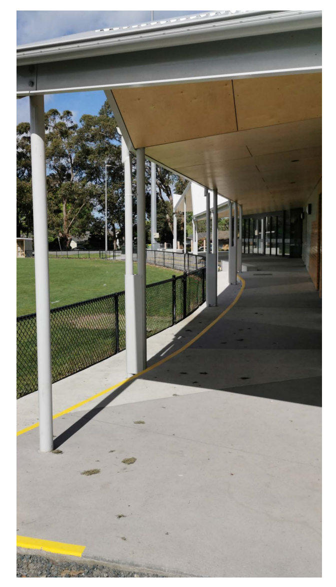
figure 3 Kilsyth Recreation Reserve

The Master Plan proposes design initiatives and improvements that are all-abilities inclusive and gender-neutral. The proposed master plan includes enhancements aimed at aiding individuals with mobility challenges, creating communal areas, and offering ageappropriate amenities such as a playspace, pump track, and multi-purpose court to promote active recreation. These improvements are not geared towards any particular gender, as there is no discernible need to do so. The master plan recommendations are founded on an inclusive, equitable approach.