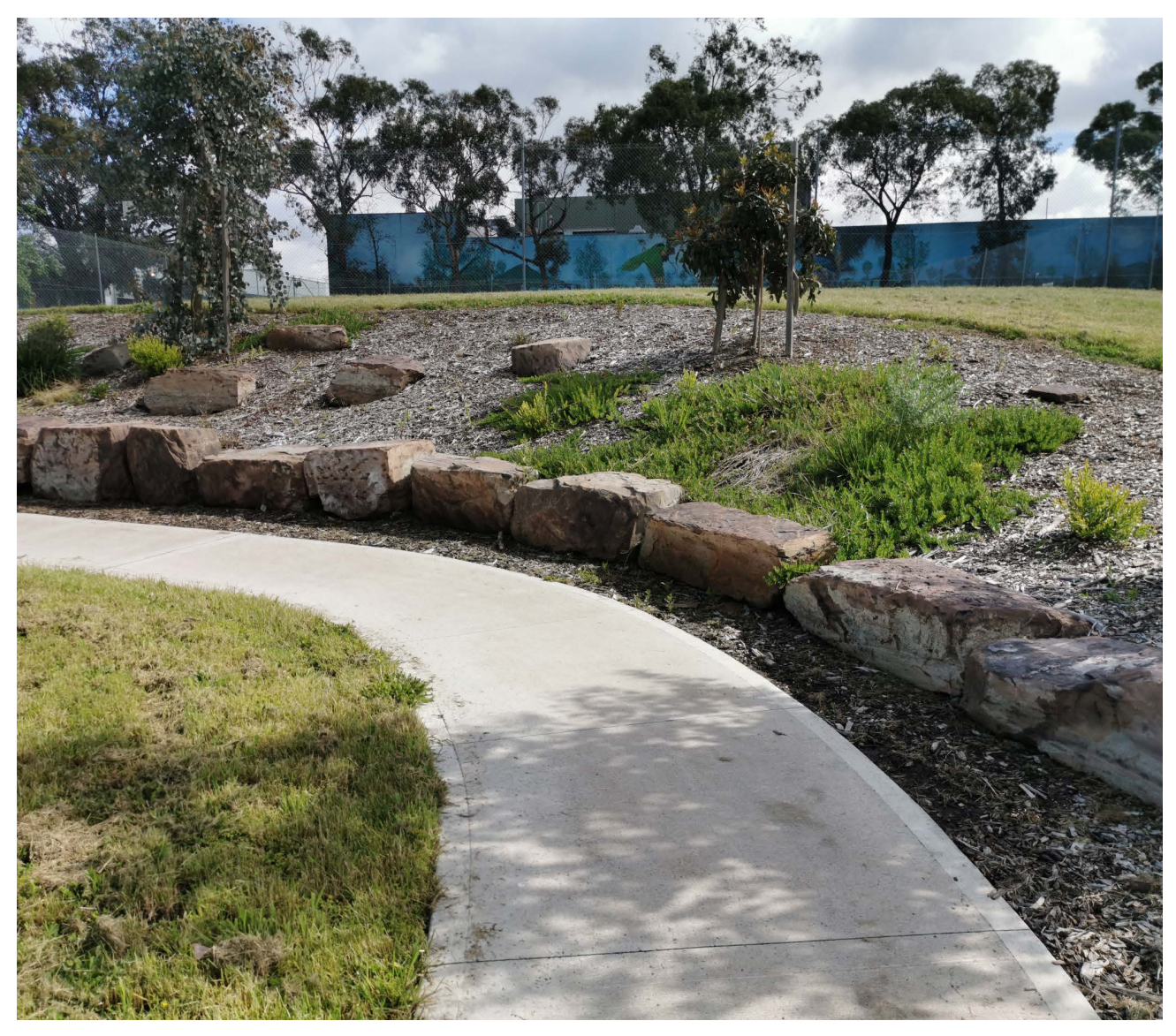
figure 4 Kilsyth Recreation Reserve

The proposed recommendations in the Master Plan are suitable for all genders. The allocation of funds will depend on the state of the assets and strategic packaging to maximize the potential to secure funding, as outlined in the 15-year project implementation plan. For instance, the removal of unnecessary courts to create space for a playspace, multi-purpose court, and social areas is given top priority. This prioritization is in line with the aim of transforming the underutilized space into a recreational area that offers a range of opportunities that will benefit the entire community.