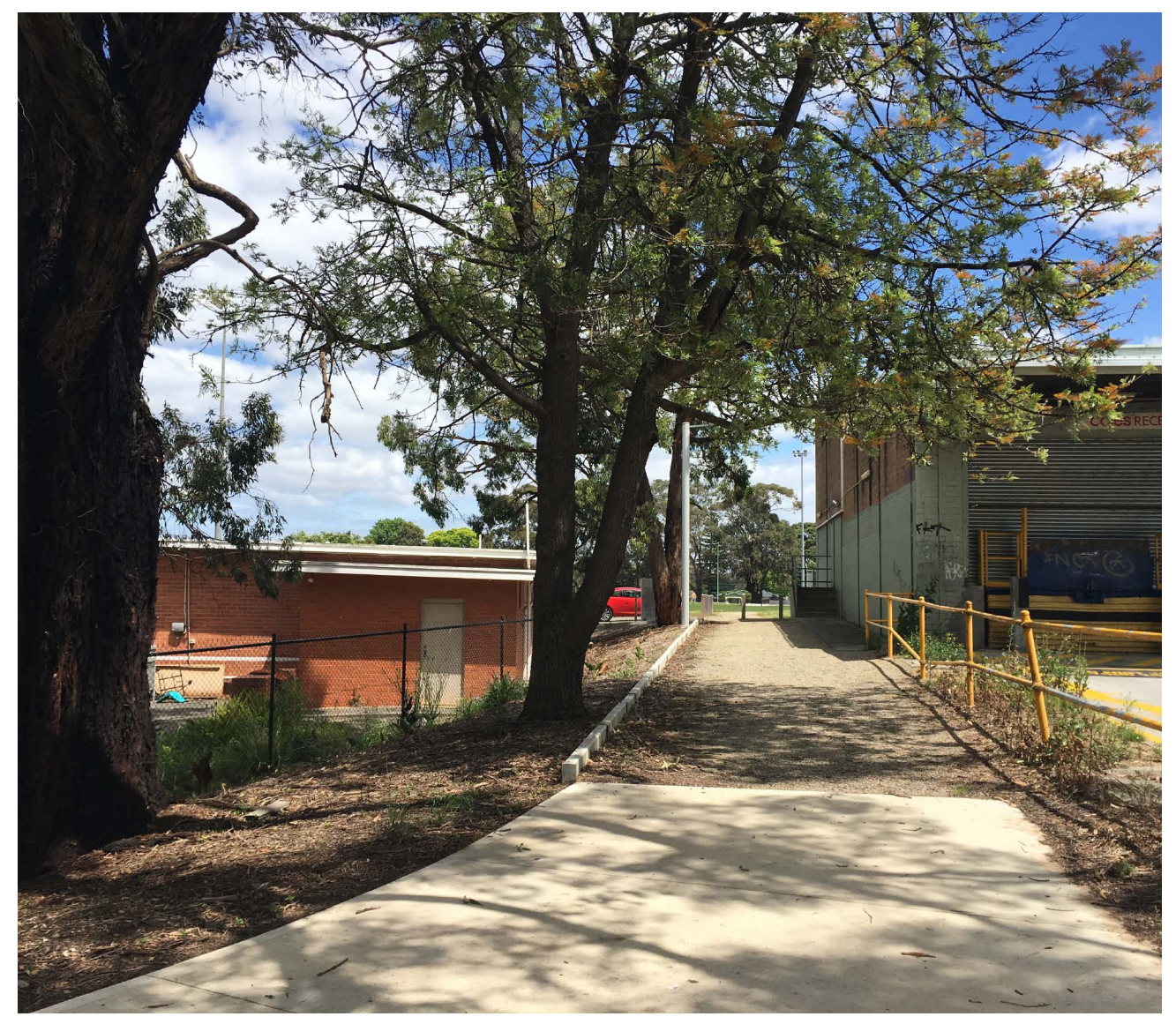
figure 2 Kilsyth Recreation Reserve

Currently, the facilities at the reserve are mainly used by male and, to a lesser extent, female AFL football participants. Older individuals utilize the reserve to access the shopping complex and briefly rest when needed. However, there is a lack of features that attract the general community for usage.